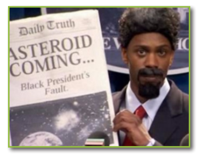
Although one of the primary critiques of Chappelle's Show is that the humor deflated the social commentary and impact, data indicates otherwise. Indeed, the format allowed people to laugh, but the

among several others. In this manner, the intent is to demonstrate a valid vision of a racialized present and predictors of a racialized future through social exchange. This is demonstrative in the discussion between the Frontline journalist and his interview with the reclusive, famed White supremacist, Clayton Bigsby. Such sketches were break-through because they expertly suggest that racial identity is dependent upon socialization with no meanings other than those that society ascribes and perpetuates through cultural transmission and social and political phenomena to create variance. As a result the sketches, via depiction of characters in extreme fashion, provide commentary on the irrationality of stereotypes attributed to a variety of ethnic groups. On a consistent basis the show enabled the audience to confront common images and stereotypes of their own as well as those of society at large, in an extremely sophisticated manner of comedy.